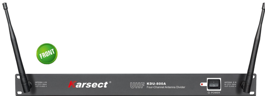
KDU-800A ANTENNA DIVIDER

Carrier Range:460-970MHz Gain:15dB RF Input:TNC or BNC, 50 Ohms RF Output:TNC or BNC, 50 Ohms DC Power:9V DC, supplied through connecting cable from KDU-800 or other PLL systems DC Power:DC 13-15V Dimensions:6.5x3.4x3.4cm