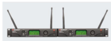
19-inch Audio equipment rack