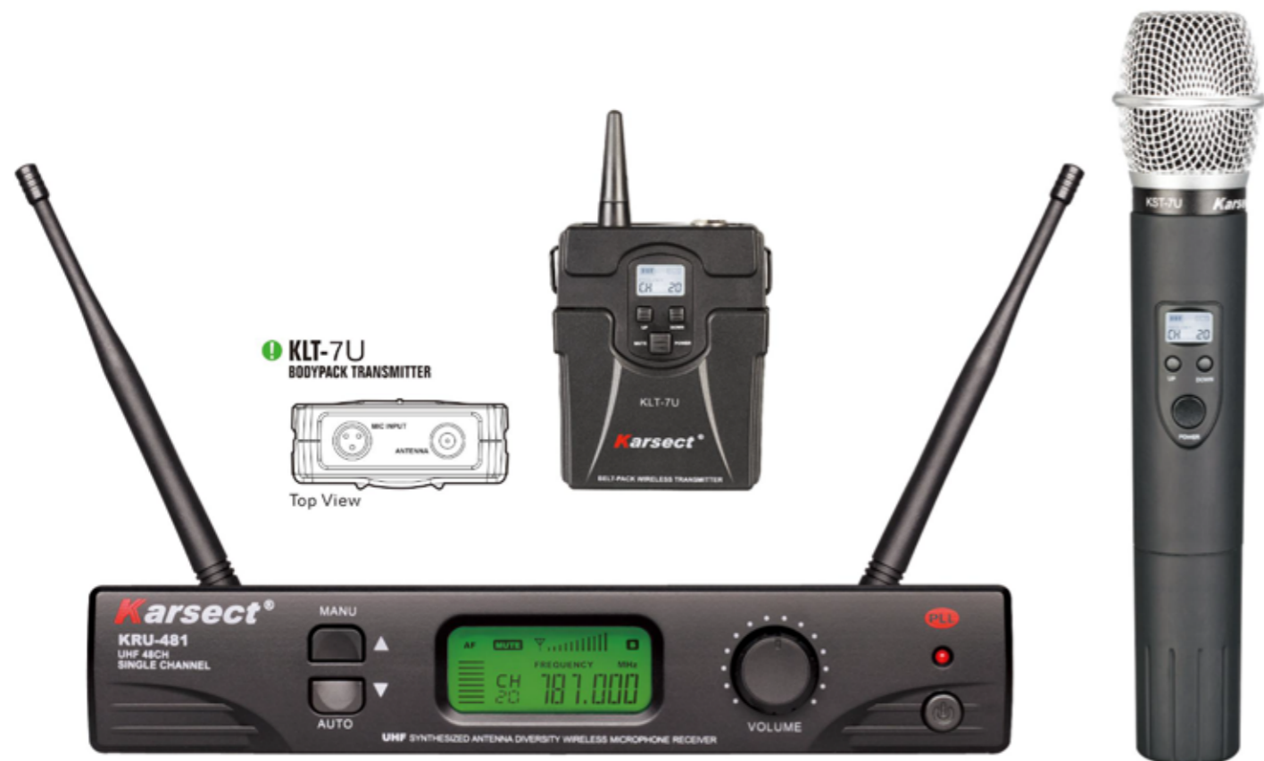
KLT-7U BODYPACK TRANSMITTER