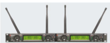
19-inch Audio equipment rack