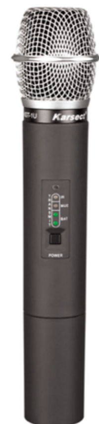
① KST-1U HANDHELD TRANSMITTER