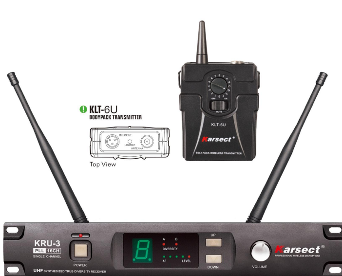
! KLT-6U BODYPACK TRANSMITTER