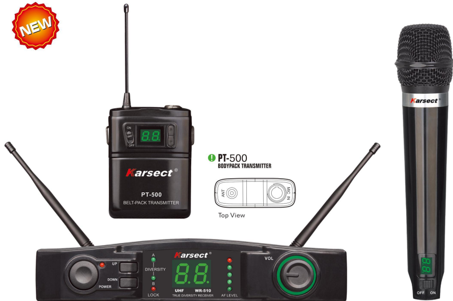
PT-500 BODYPACK TRANSMITTER Top View