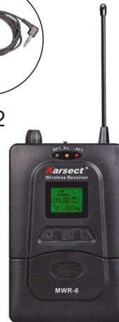
MWR-6 16CH STEREO RECEIVER