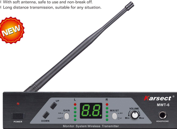
MWT-6 16CH STEREO TRANSMITTER