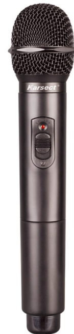
1 IR-5T HANDHELD TRANSMITTER