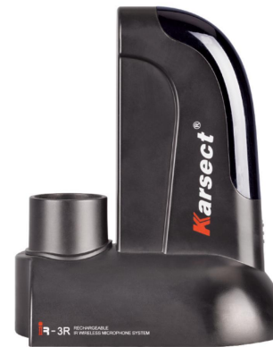
2 IR-3R SINGLE CHANNEL RECEIVER