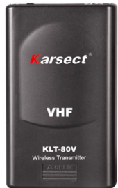
KLT-80V BODYPACK TRANSMITTER