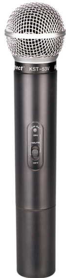
KST-53V HANDHELD TRANSMITTER