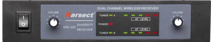
KRV-202 DUAL CHANNEL RECEIVER